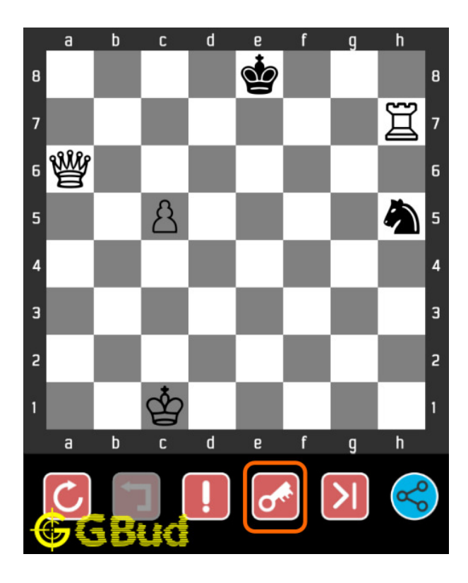
Figure 1.3: Click the solution button to view solutions @ https://gbud.in/gmf3f51