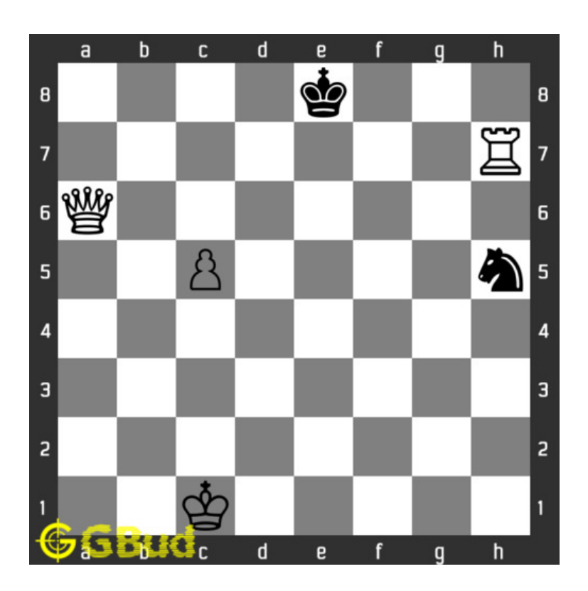
Figure 1.1: Solve this easy chess puzzle 0011. Check mate in one move @ https://gbud.in/gmf3f51