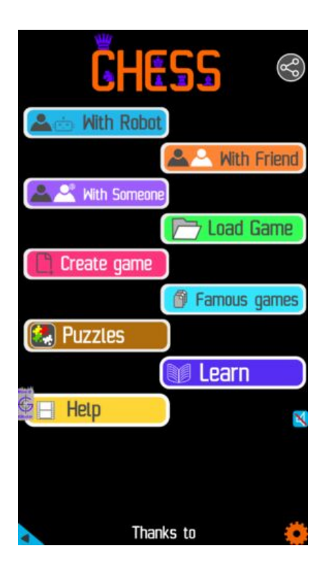
Figure 1.7: Play chess online for free. Solve puzzles and play with friends

Play chess for free at https://gbud.in/chs